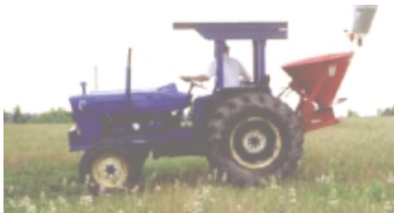
Figure 5. Herd GT77 seeder mounted on a fertilizer spreader.

Baits can be broadcast applied using handheld seeders or spreaders. They must be calibrated to apply the amount of product per acre as directed on the product label. Rotating or vibrating agitator mechanisms are preferable because they do not grind the bait particles, which can result in clogging. The hopper opening should be adjusted as small as possible to allow bait to drop onto a spreader fan. Calibrate by applying a known quantity of bait to an area of known size. For larger areas, use a vehicle-mounted, electrically powered applicator such as a Herd GT77 seeder specifically manufactured to broadcast apply ant bait products. Baits can also be applied aerially provided the crop duster hopper and gate are modified to achieve the low use rates for these products.