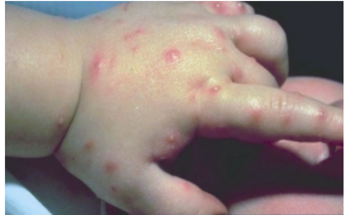
Figure 2. Texas A&M fire ant image gallery