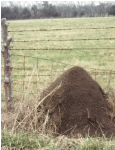
Figure 1. Imported fire ants build mounds that are unsightly and that interfere with farm operations.

Two species of imported fire ants were accidentally introduced into the southern United States from South America in the early 1900s. The red imported fire ant, Solenopsis invicta , and the black imported fire ant, Solenopsis richteri , interbred and produced sexually active hybrid ants in areas where they occurred together, such as in the northern portions of Mississippi and Alabama and adjoining parts of Tennessee and Georgia.