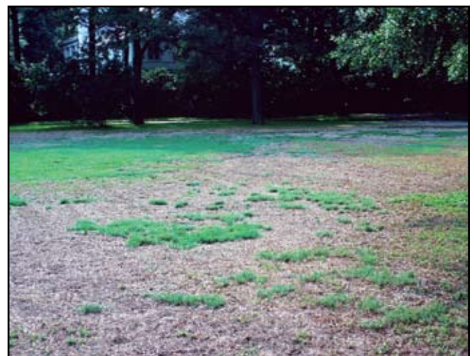
Figure 1. Chinch bug damage to a St. Augustinegrass lawn. Note the patches of bermudagrass left unharmed.

to the irregular-shaped areas of dead and dying grass that result from chinch bug feeding. Chinch bug damage also can be difficult to distinguish from that caused by drought. Detecting significant numbers of the insects themselves is the best proof of chinch bug damage.