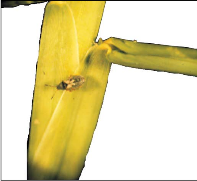
Figure 2. Southern chinch bug on St. Augustinegrass blade.

tractive as a food source for chinch bugs. No more than 3 to 4 pounds of nitrogen per 1,000 square feet should be applied each year to St. Augustinegrass in sunny locations. Grass in shady sites needs no more than 2 pounds of nitrogen per 1,000 square feet each year. Organic, or slow-release, fertilizers reduce the risk of over-fertilization because they release nitrogen more slowly. Local nursery professionals or your county Extension office can provide more information on soil sampling and determining the proper amount of fertilizer to use on your lawn.